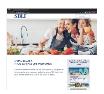
Sales & Marketing Resources Microsite