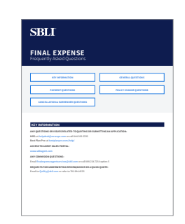
Final Expense Insurance FAQ's