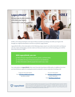
The LegacyShield® Consumer Brochure